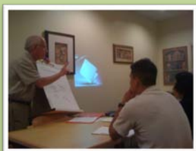
Recent Classes at UMCM

UMCM: I would tell them that Project Prosper is an exceptional organization to partner with to help meet the needs of the group one is serving. With the flexibility to concentrate on the topic of financial literacy subject matter that is relevant and interesting to those learning, not only excites, but empowers. After learning something relevant to one's life such as creating a budget, one's entire outlook and way of life can be altered for the better. Project Prosper is providing that necessary tool of financial independence by empowering one with information.